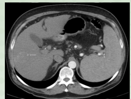
CT Images of Pre-TACE