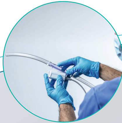
The H/S Cuvette is installed into the H/S Probe.