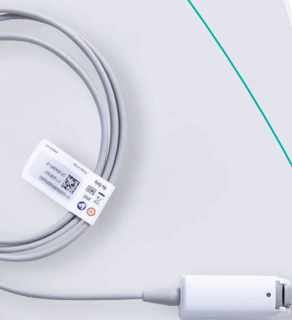
Hematocrit/Oxygen Saturaton (H/S) Probe