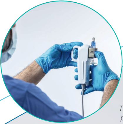
The Shunt Sensor is placed in the BPM.