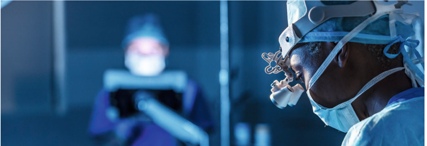
CDI OneView Monitoring System.