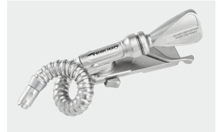
Herc Flex™ Stabilizer Arm

The Titan™ Flex stabilizer is redesigned to deliver greater versatility and articulation during off-pump cardiac surgery. It features an enhanced malleable framework that contours to a variety of heart anatomy and maintains excellent stability for exposure and anastomosis*.