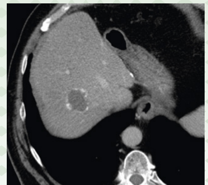
5 months follow-up contrast enhanced CT

QuiremSpheres® is a product manufactured by Quirem Medical B.V. and has CE-mark. QuiremSpheres® is not available for sale in all countries. This information is provided only in respect to markets where the product is approved or cleared. QuiremSpheres® is not FDA cleared in the US for sale. QuiremSpheres® is not approved in Canada. Terumo is the exclusive distributor for QuiremSpheres®