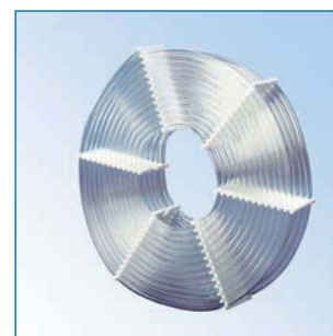
Sarns™ Cardioplegia Sets with PVC Coil

1 Made to order, expect delivery in 6-8 weeks