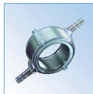
Sarns™ Conducer Heat Exchanger