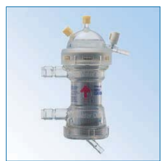
CAPIOX® CP50 Cardioplegia Set