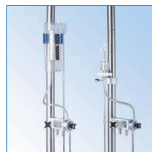
Sarns™ MP-4 Monitoring Module