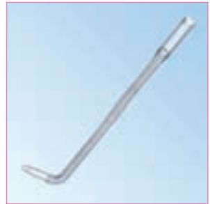
Tender Flow™ Pediatric Venous Return Cannulae