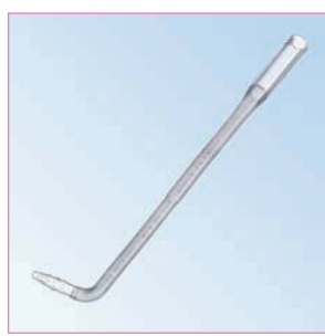
TenderFlow™ Pediatric Venous Return Cannulae