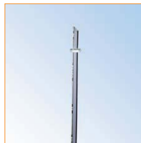
Sarns™ Flexible Arterial Cannulae