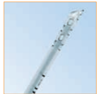
L Series Type Atrial Catheters