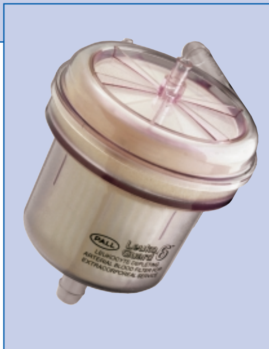
AutoVenting Blood Filter

Pall Leukocyte Reduction Arterial Blood Filter for Extracorporeal Service